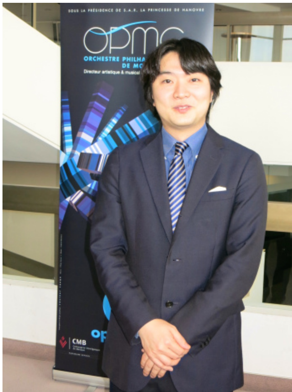
Conductor Kazuki Yamada

Yamada who since the Autumn of 2013 had been the OPMC's principal guest conductor, appears regularly with the Paris Orchestra , Philharmonia Orchestra , Dresden Philharmonic , Rundfunk Sinfonieorchester Berlin , St Petersburg Philharmonic , Czech