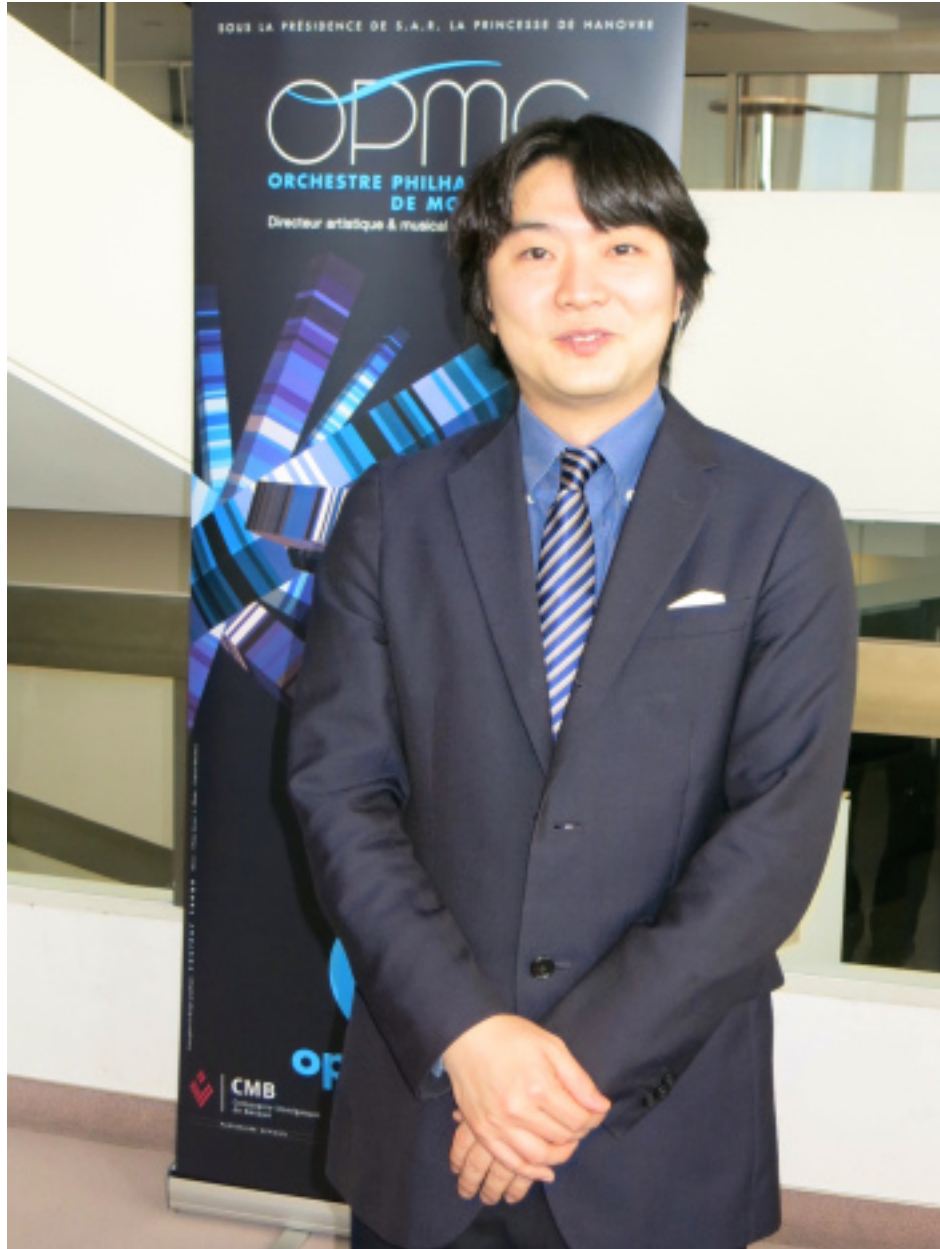
Conductor Kazuki Yamada

Yamada who since the Autumn of 2013 had been the OPMC's principal guest conductor, appears regularly with the Paris Orchestra , Philharmonia Orchestra , Dresden